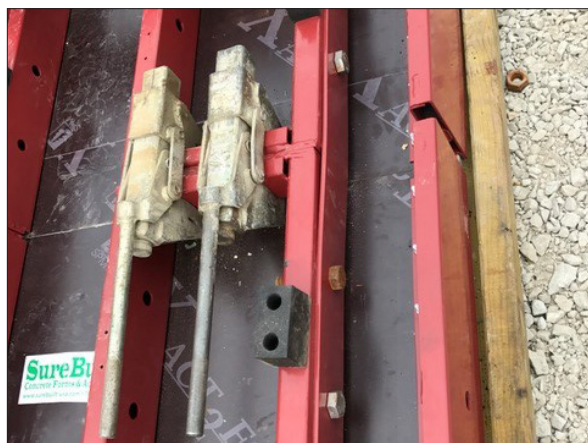
Connecting clamps and stacking plate span the joint between two SureCurve panels.