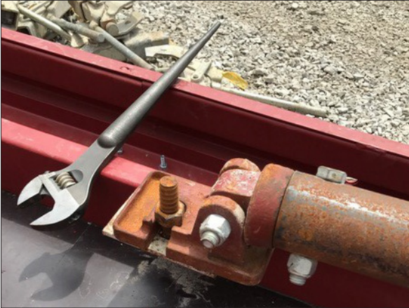
Bracing can travel with each SureCurve gang using the shoe attachment plate.