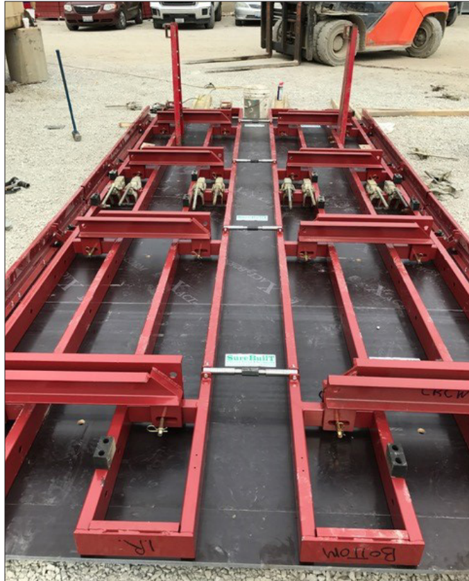
The SureCurve panels can be assembled into a gang, including all the connecting hardware and accessories, while safely on the ground.